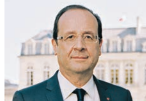
François Hollande President of the French Republic