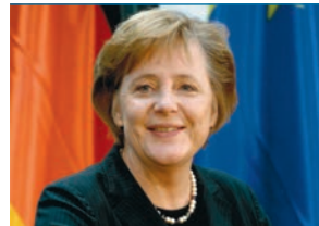
Angela Merkel Chancellor of the Federal Republic of Germany