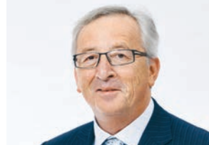
Jean-Claude Juncker President of the European Commission